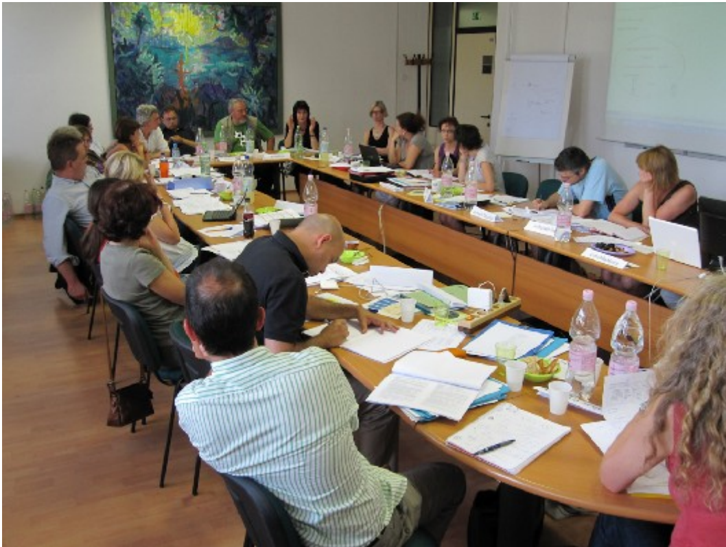
Meeting in Ljubljana

A key event of the first project year was the second consortium meeting held in Ljubljana, Slovenia, from 1st to 3rd of July, 2010. Representatives of all partner teams attended making up for more than 40 participants.