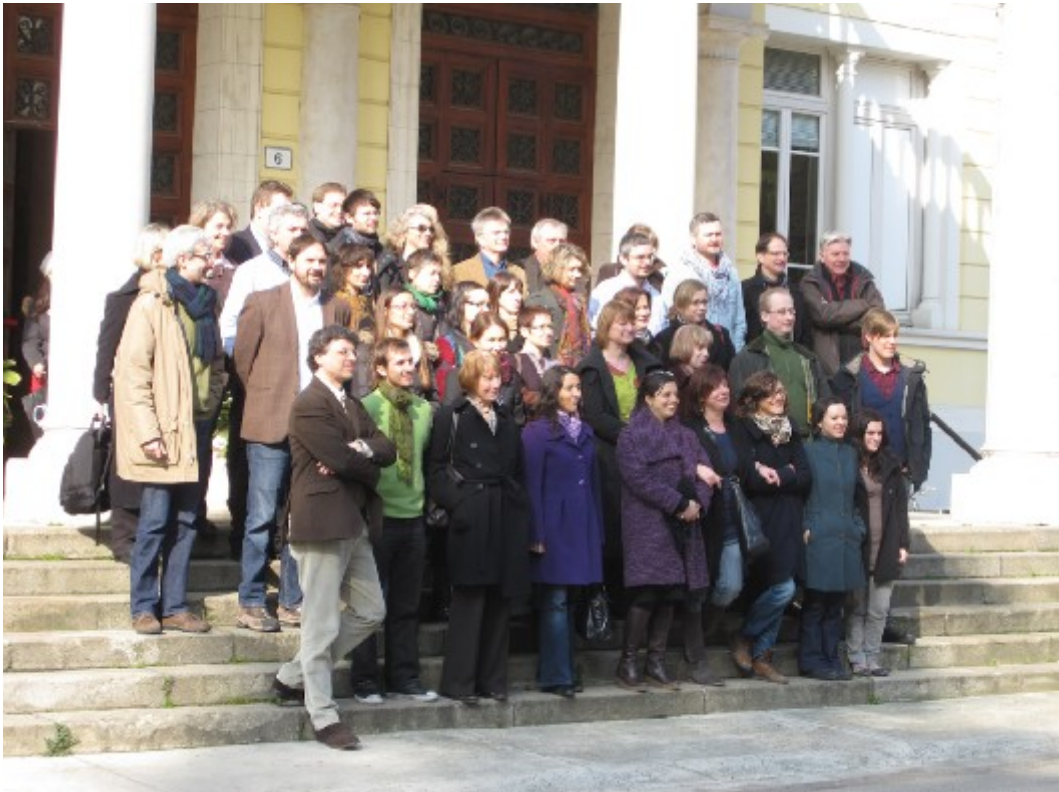
Members of the GOETE Team in front of the University of Bologna