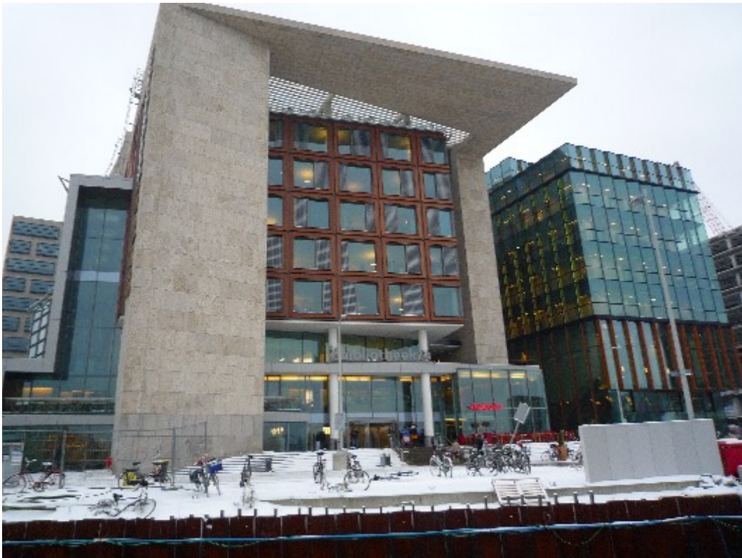
Bibliotheek of Amsterdam

Delegates from all participating GOETE partners involved in the qualitative case studies came together the 3 rd and 4 th of December 2010 in Amsterdam (the Netherlands) to discuss the current development and urgent issues regarding sampling and methodology of the qualitative case studies.